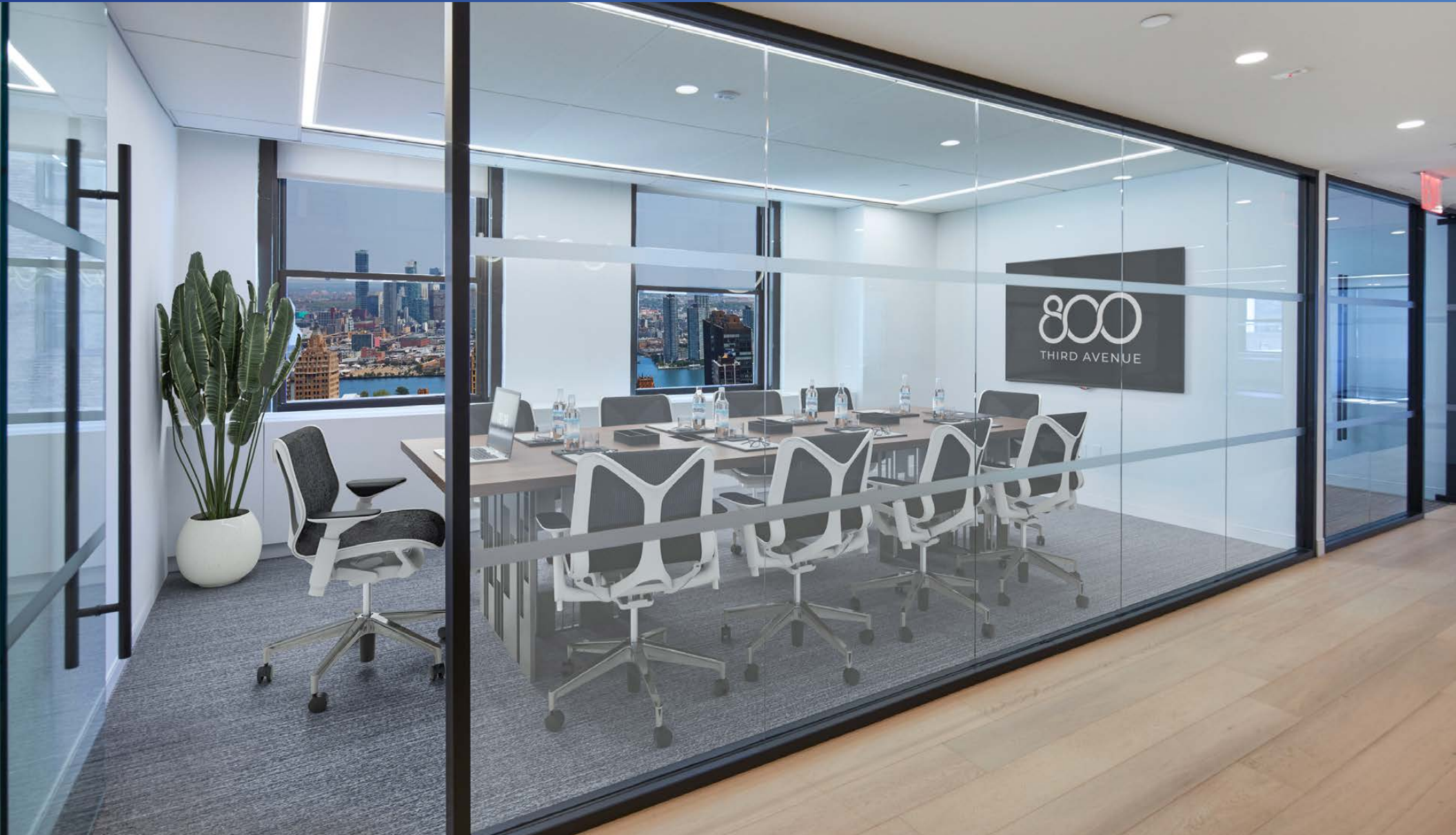
GLASS FRONT CONFERENCE ROOMS