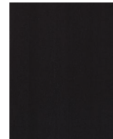
CABINET WOOD Shinoki | Raven Oak