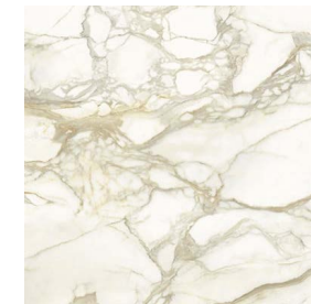
BACKSPLASH & COUNTERTOP Fiandre | Calacatta Dorato