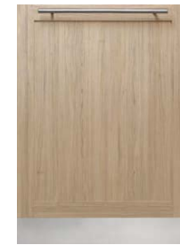
DISHWASHER Asko | D5526xlf ADA height panel ready