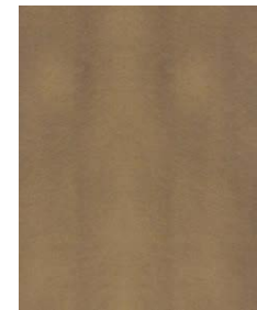
BAR BASE Chemetal | Agred Brass Dark