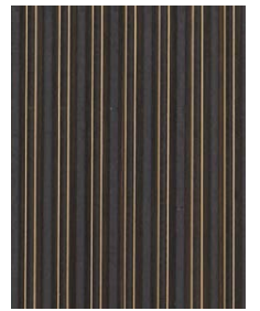
BAR PANELS Plyboo | Louver Wall Panels | Butterfly BY15BN Bronze Noir