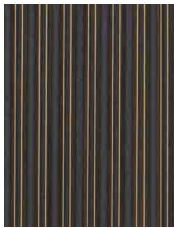
BAR PANELS Plyboo | Louver Wall Panels | Butterfly BY15BN Bronze Noir