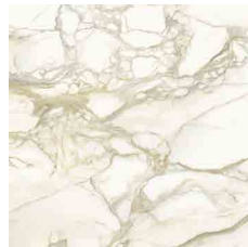
BACKSPLASH & COUNTERTOP Fiandre | Calacatta Dorato