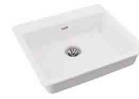
SINK Elkay | Elkay Quartz Classic 25" x 22" x 5-1/2" ELGAD2522PDWH0