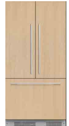
FRIDGE Fisher Paykel | 36" French door panel ready