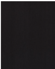
CABINET WOOD Shinoki | Raven Oak