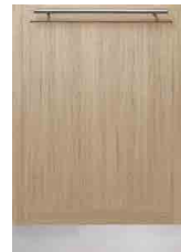
DISHWASHER Asko | D5526xlf ADA height panel ready