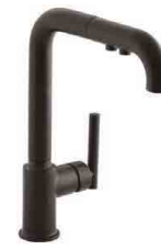
FAUCET Kohler | Purist K-7505-BL Black