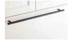
APPLIANCE PULL Signature Hardware | Hatton Solid Brass A ppliance Pull 18" Matte Black