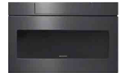
MICROWAVE Sharp | 24 Inch Microwave Drawer with Easy Touch, Black stainless SMD2470AH