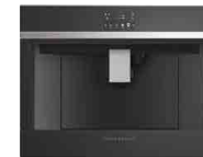
COFFEE MAKER Fisher Pike | 24 Inch Built-In Coffee Maker EB24DSXB1