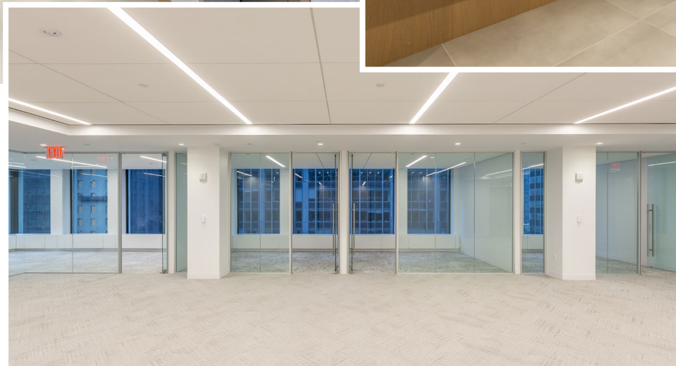
PRE-BUILT OFFICE FRONTS