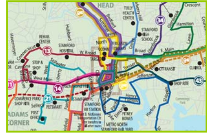
Image 2: CT Transit bus lines within ¼ mile from 750 Washington Blvd in Stamford

To reduce pollution and land development as a result of automobile use, the LEED-CI program encourages tenants to choose a space that provides access to modes of alternative transportation. 750 Washington Blvd is within a ¼ mile (close walking distance) to a number of CT Transit bus lines. This accessibility to public transportation provides tenants an opportunity to commute in a more sustainable manner and reduce carbon emissions from single-occupancy vehicle use.